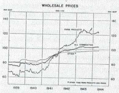
Bureau of Labor Statistics' indexes. Weekly figures, latest shown are for week ended May 13, 1944.