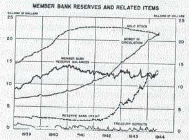
Wednesday figures, latest shown are for May 17, 1944.