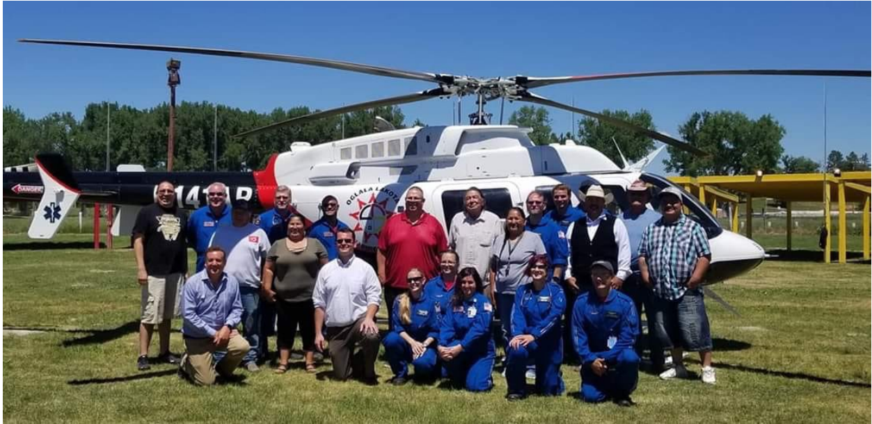
Figure 1. Launch of Oglala Lakota Air Rescue, the first native-owned medical airlift service, on July 2, 2019.