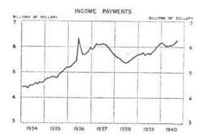
U. S. Department of Commerce estimates of the amount of income payments to individuals adjusted for seasonal variation. By months, January 1934 to September 1940.

Index of physical volume of production, adjusted for seasonal variation, 1935-1939 average=100. Durable manufacturers, non-durable manufactures, and minerals expressed in terms of points in the total index.