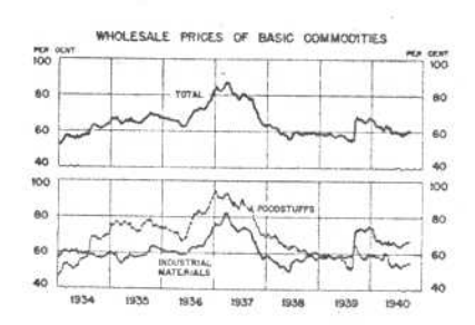
Federal Reserve groupings of Bureau of Labor Statistics data. Thursday figures, January 4, 1934 to October 10, 1940.