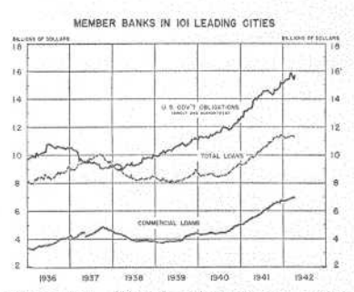
Wednesday figures. Commercial loans, which include industrial and agricultural loans, represent prior to May 19, 1937 so-called "Other loans" as then reported. Latest figures shown are for April 8, 1942.