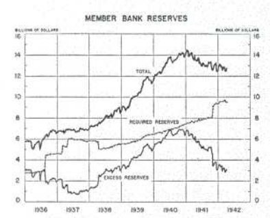
Wednesday figures. Required and excess reserves, but not the total, are partly estimated. Latest figures shown are for April 8. 1942.