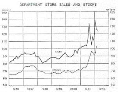
Federal Reserve monthly indexes of value of sales and stocks, adjusted for seasonal variation, 1923-25 average=100. Latest figures shown are for March, 1942.